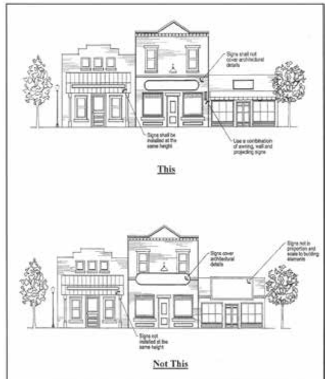
Figure 16-8-1. Signs and architectural details.

(b) Materials. Signs shall be constructed of durable, high quality architectural materials. The sign package must use materials, colors and designs that are compatible with the building facade. Sign materials must be of proven durability. Treated wood, painted metal, stone, brick and stucco are the preferred materials for signs. Plastic, vinyl and fabric materials, including banners and stake signs, are